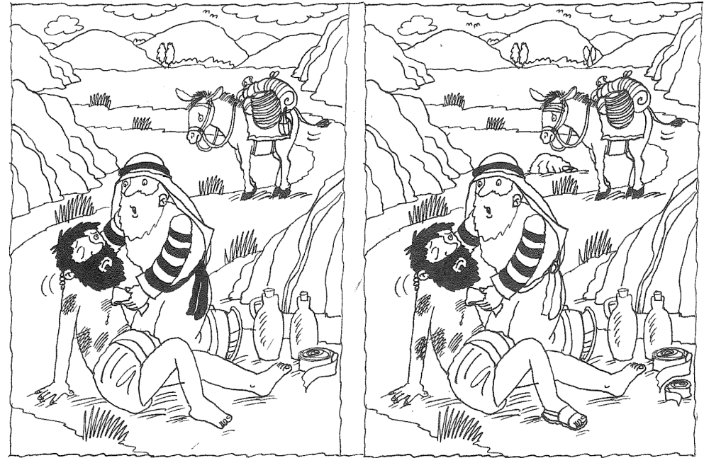
A good man from Samaria helped the wounded man. Can you find ten differences between these two pictures?