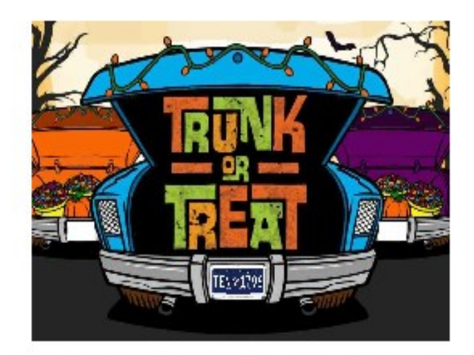
First United Methodist Church 993 Market Street Dayton, TN 37321 October 25, 6:00 – 8:00pm