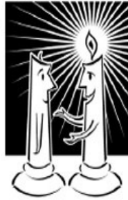
Jesus Is the Light